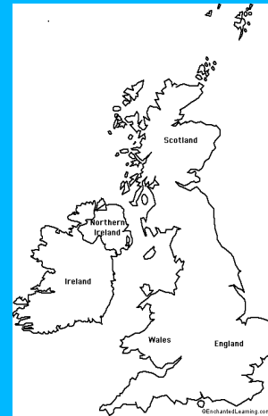
The British Isles

2. Ireland has got two names? Which are they?